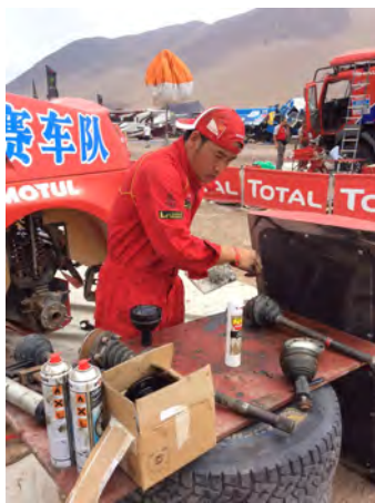
Leg 9: Iquique - Calama (Chile)