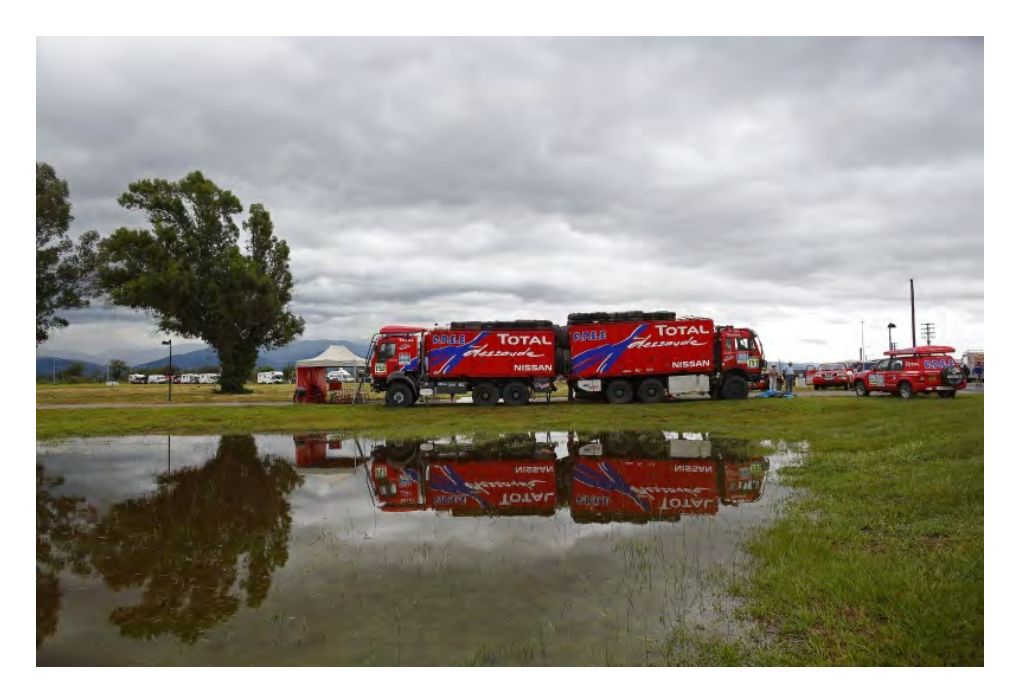
Leg 10 : Calama (Chile) - Salta (Argentina)